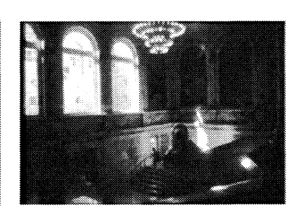
Figure 2: View of McKim's building from H. H. Richardson's Trinity Church across the square, and a sequence of interior public spaces from the entrance, to the grand staircase through to the vestibule leading to reading and delivery rooms.